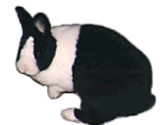
“Uh, I think this is where I leave.”