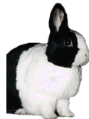
“I am just not sure about you, Bub.”