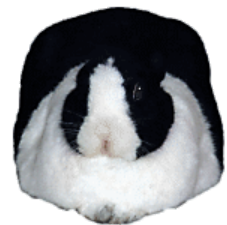
“I’ll lend you an ear, but two you’ll have to earn.”