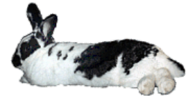
Lounging is my life.