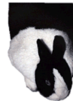
"You there. Nose rub. Now."