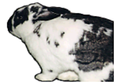
“You don’t love me anymore.”

A rabbit that is very scared or nervous may “thump” a hind leg, slapping it hard against the ground. This isn’t just a warning to other rabbits, but to you, too. Note that rabbits sometime also thump to indicate anger, or even just to say “pay attention,” but it should be pretty easy to distinguish these by the context.