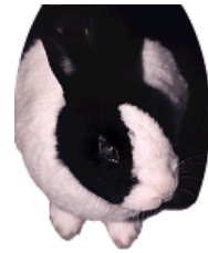
"Got a raisin?"