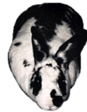
"I deserve a nose rub."

Some very aggressive rabbits may use biting even more than grooming to establish and demonstrate their dominance. A rabbit establishing dominance by biting typically won't just nip, as rabbits may do to get your attention or even because they're excited, but instead may bite down hard and even hold on tight. Obviously you will want to break the