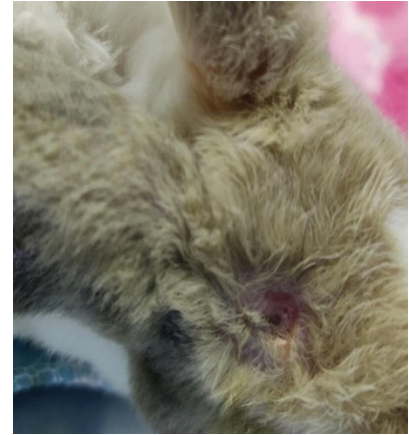
Bot Fly Hole

We cannot emphasize enough the importance of keeping a house rabbit indoors. They cannot withstand the Florida heat. They cannot protect themselves from predators, and we have many. Wild animals in Florida are in every neighborhood and backyard. Keep your rabbit safe— INDOORS .