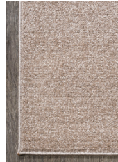
Low Pile Carpet 4x6