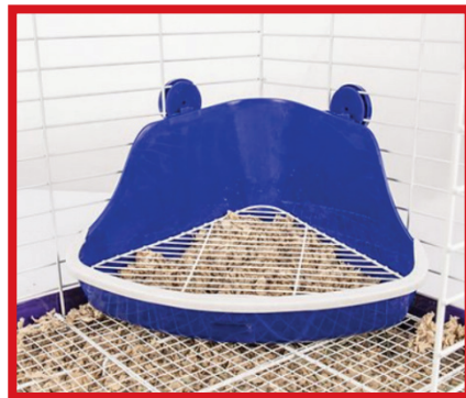
Bad litter box