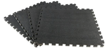
Garage Floor Foam Tiles

The equipment you see above is ideal for house rabbits. If you have a rabbit that likes to jump, a sheet placed over the top of the pen usually deters this behavior. If the rabbit continues to jump out of the pen, a metal frame top can be purchased from Midwest™. This only works in the square configuration. Again, no cages or hutches are recommended.